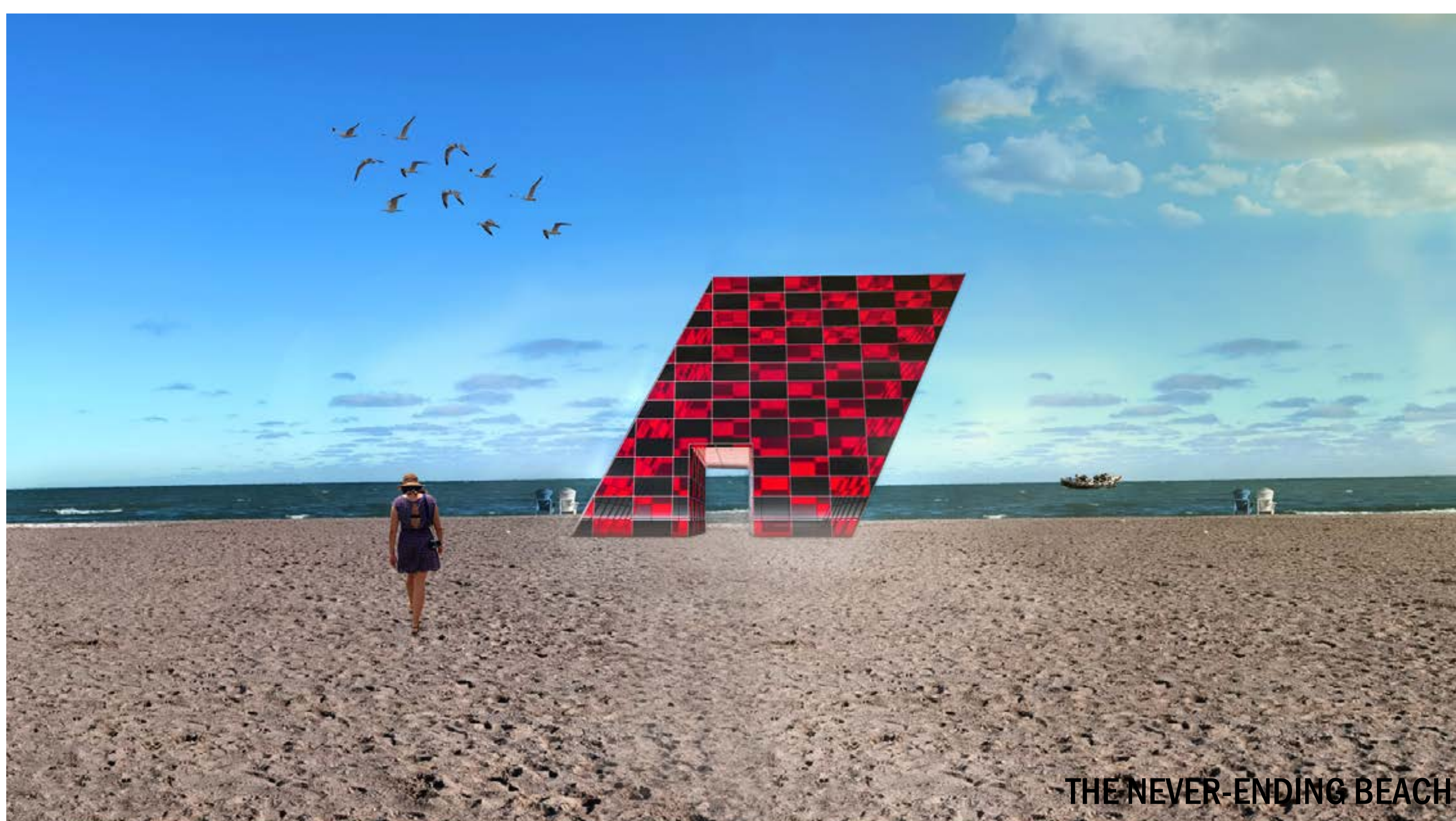
THE NEVER-ENDING BEACH