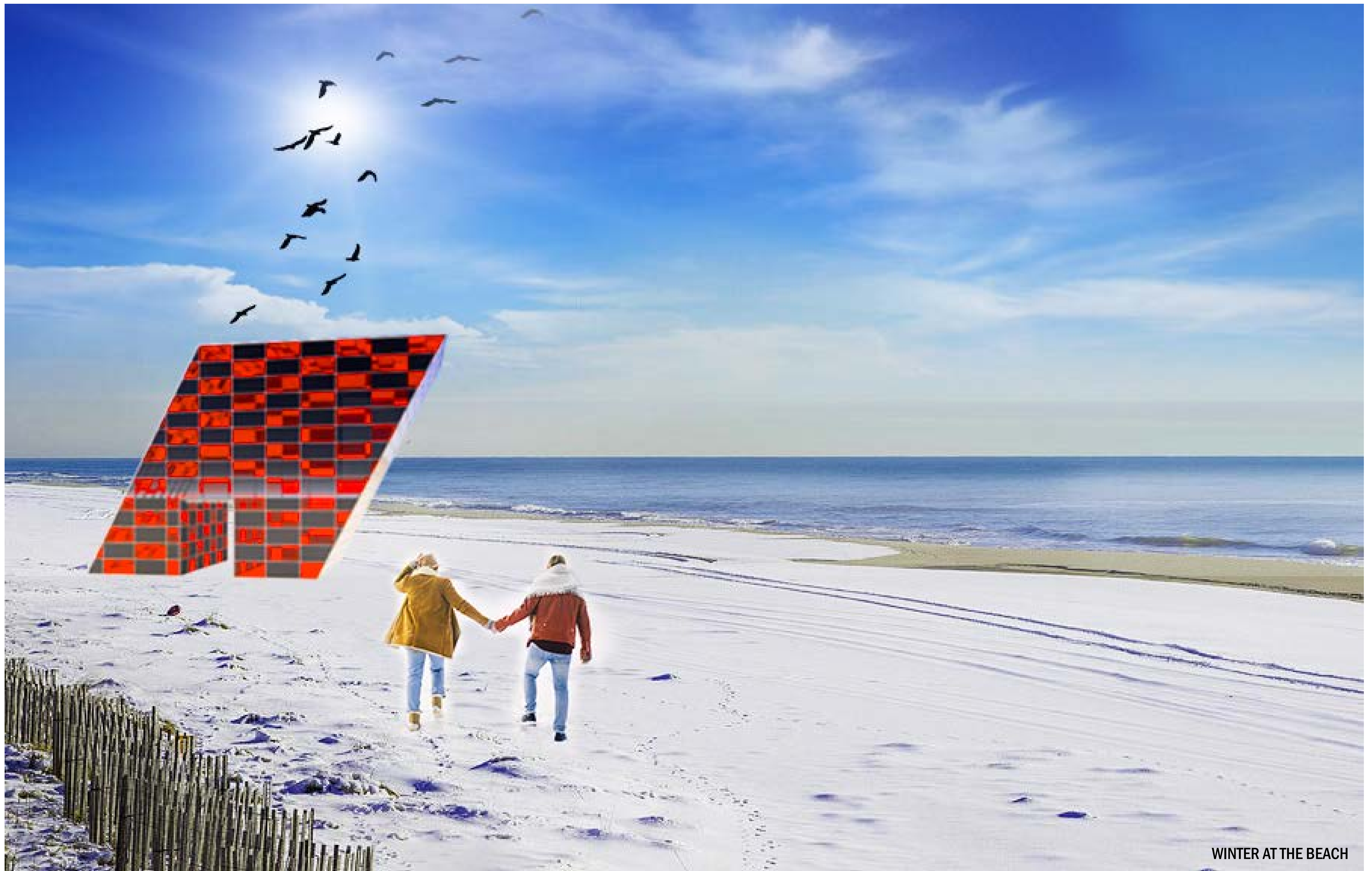
WINTER AT THE BEACH