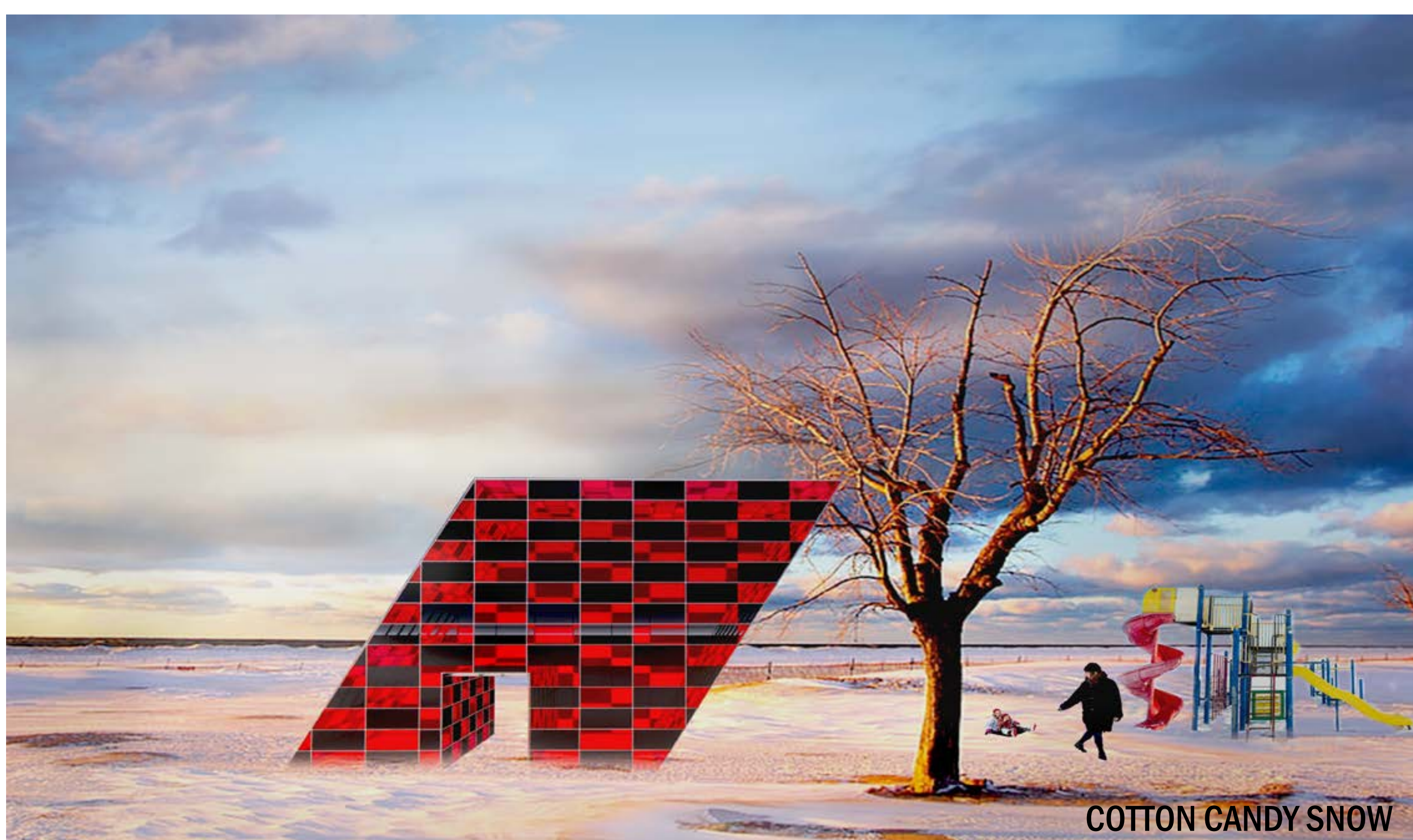
COTTON CANDY SNOW